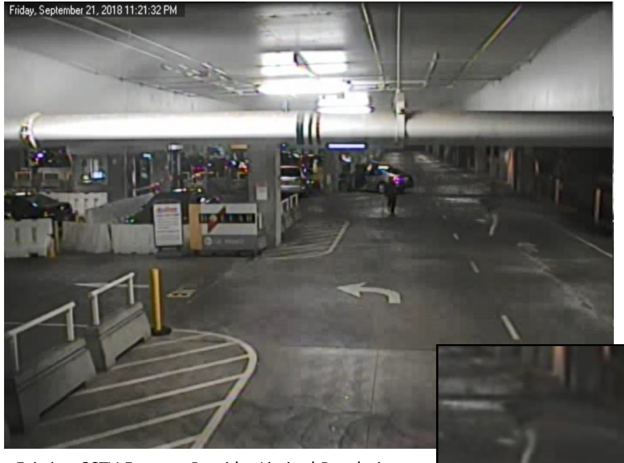
Existing CCTV Footage Provides Limited Resolution